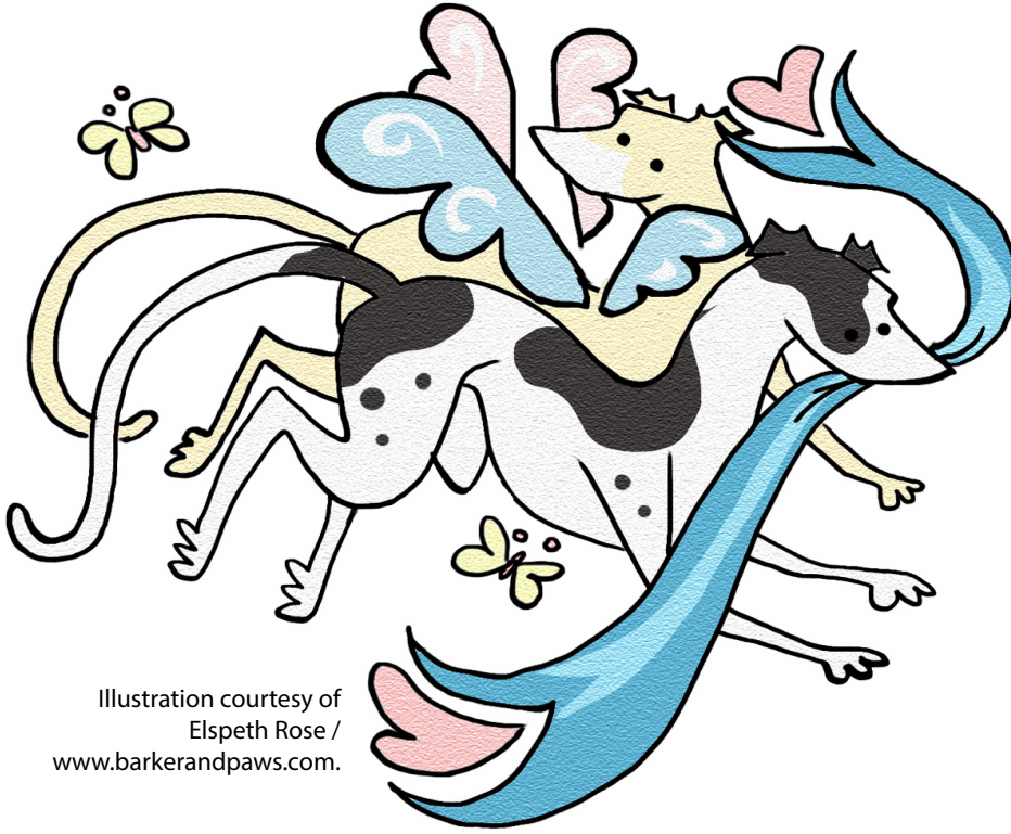
Illustration courtesy of Elspeth Rose / www.barkerandpaws.com.