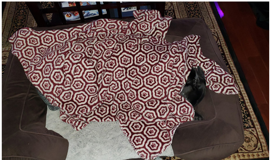
Can you find the hidden greyhound? Flo-Jo was unwilling to go out during the recent cold snap.